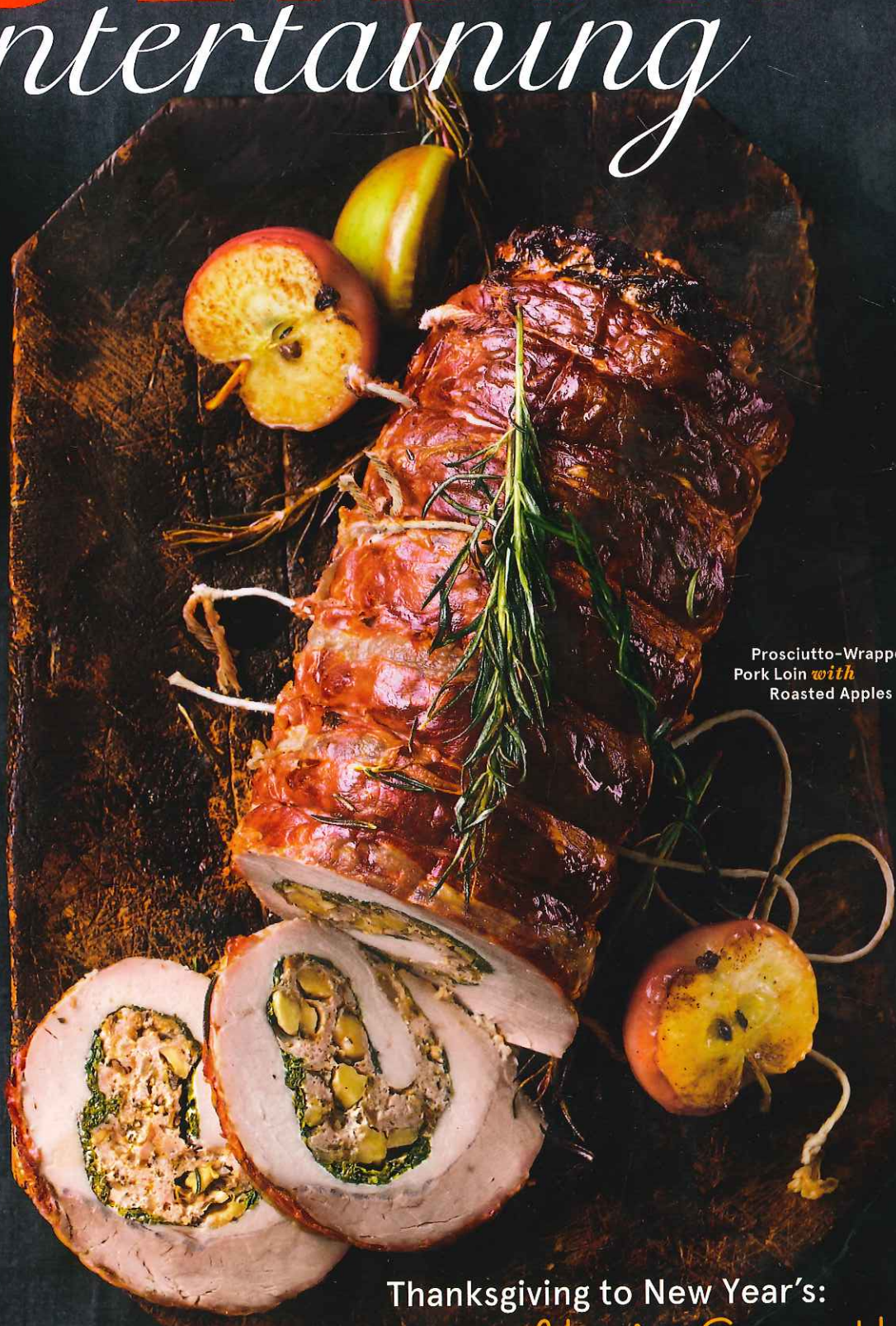
Prosciutto-Wrapped Pork Loin with Roasted Apples